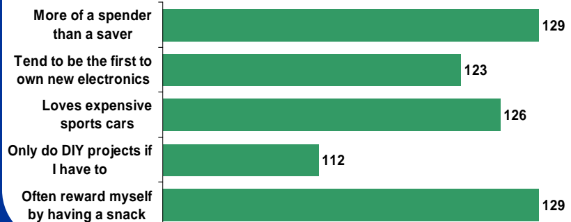
TVtropolis Viewer Consumer Profile % of A18-49 English Canada Indexed to Population PMB 2009 Spring 2 Year Study